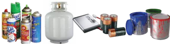
Aerosol Cans, Propane Tanks, Batteries & Paint Cans