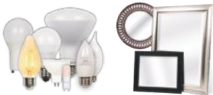
Light Bulbs & Plate Glass/Mirrors