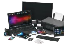
Electronics, Cords & Christmas Lights