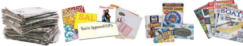
Newspaper, Office Paper, Paper Bags, Junk Mail, Paperboard & Magazines

Paper Place loose in cart. Use clear plastic bags for shredded paper ONLY .