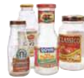
Clear Bottles & Jars