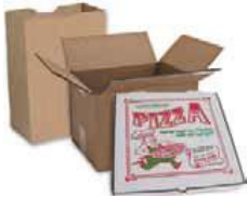
Cardboard & Pizza Boxes Flatten cardboard. Remove wax paper from pizza boxes