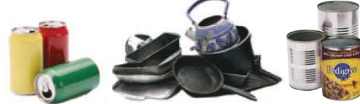
Aluminum Cans, Metal Cookware, Steel & Tin Cans