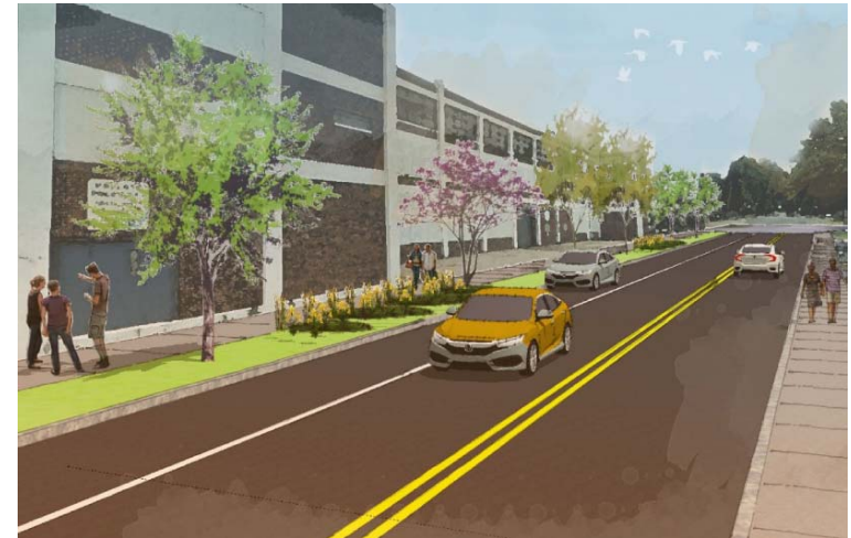
Green Infrastructure is proposed along the north side of South Street as proposed in the Downtown Revitalization Initiative (DRI)