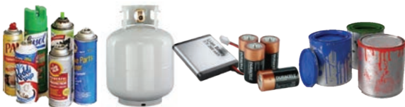
Aerosol Cans, Propane Tanks, Batteries & Paint Cans