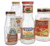
Clear Bottles & Jars