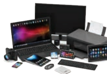
Electronics, Cords & Christmas Lights