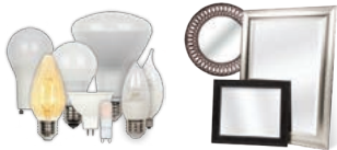
Light Bulbs & Plate Glass/Mirrors