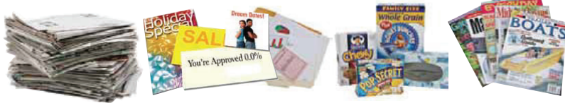
Newspaper, Office Paper, Paper Bags, Junk Mail, Paperboard & Magazines

Place loose in cart. Use clear plastic bags for shredded paper ONLY .