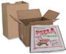
Cardboard & Pizza Boxes Flatten cardboard. Remove wax paper from pizza boxes