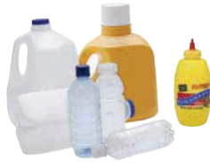
Jugs & Bottles with Small Top Openings ♻️ ♻️