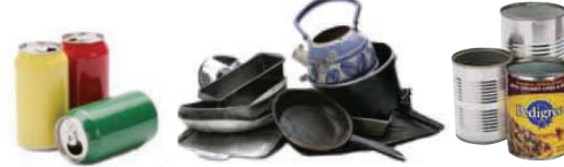
Aluminum Cans, Metal Cookware, Steel & Tin Cans