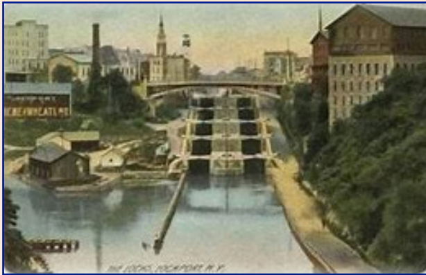
Lockport's Twin Staircase of Locks (c. 1880)

America's Stairway places the historic Flight of Five locks on the Erie Canal in Lockport, New York, squarely in the American narrative as a symbol of a young and developing nation. It draws a direct line between the Erie Canal, the Flight of Five, and the birth of American tourism to today's heritage tourism industry which is inextricably linked to community-based, grassroots preservation efforts and a community's sense of place. In doing so, it has meaning and resonance that transcends both time and geographic location.