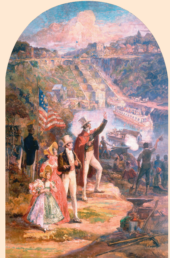
Celebration of the Opening of the Erie Canal

The epic story of how one of America's first successful public works emboldened a nation to move westward, and how in the 21 st Century it has enabled a new generation to revitalize itself