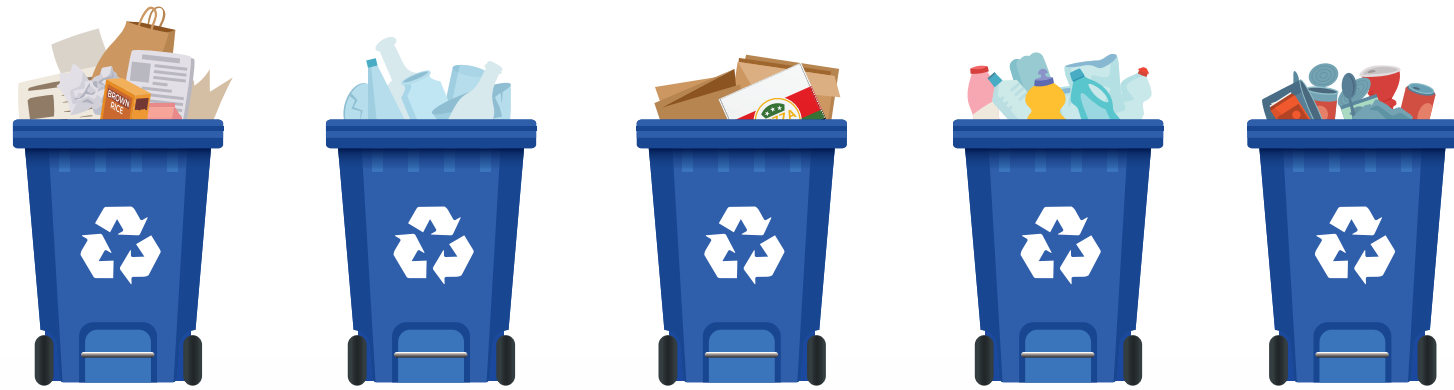
PAPER BOTTLES & JARS CARDBOARD PLASTIC CONTAINERS METAL

Recyclables placed in plastic bags will be disposed of as trash. The only exception is clean shredded paper is accepted in clear plastic bags. All recyclables should be placed in the cart loose.